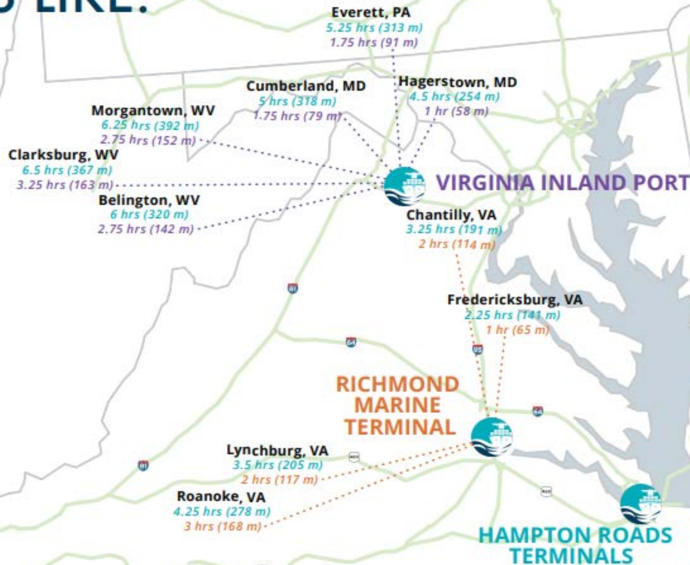
TRAVEL TIME FROM THE PORT OF VIRGINIA TERMINALS TO INLAND DESTINATIONS