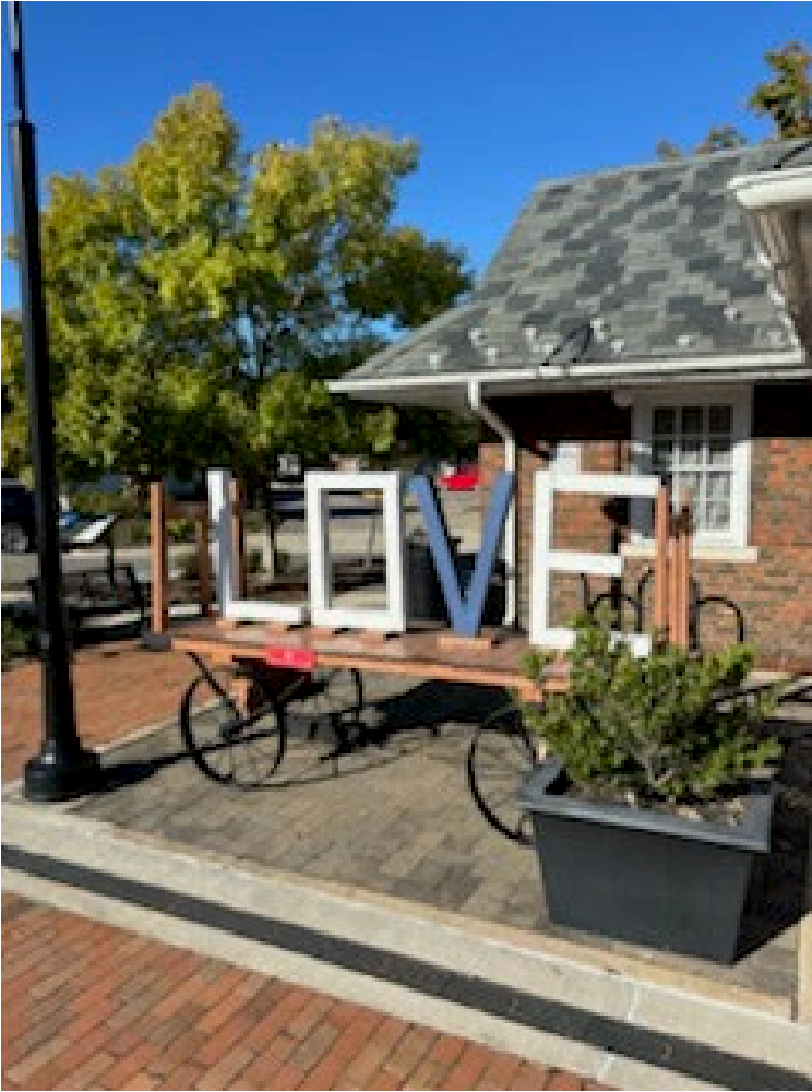
Photo: Ashland LOVE sign