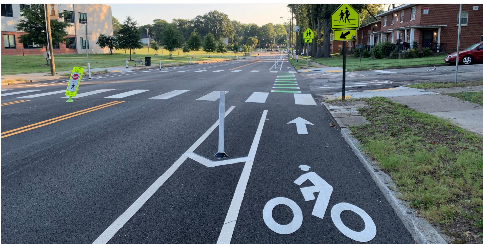
Richmond: Mosby St. bike lanes