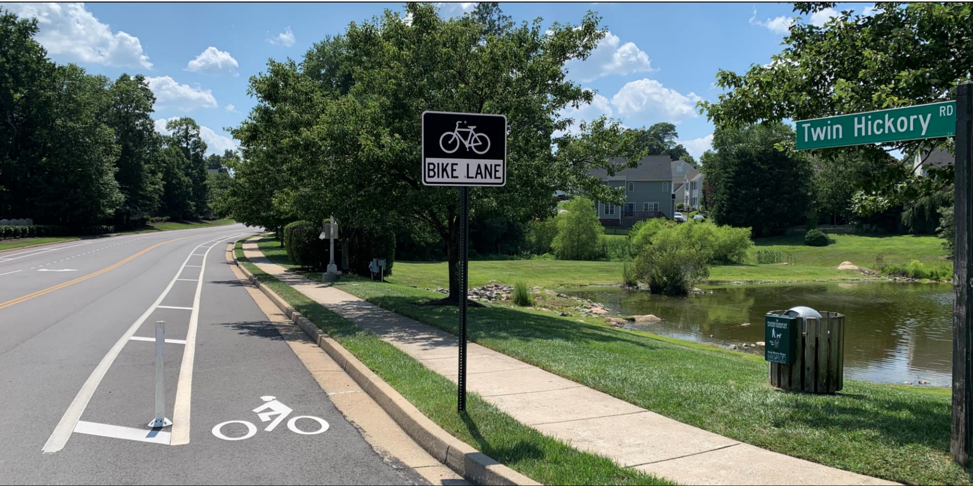
Henrico: Twin Hickory Rd.