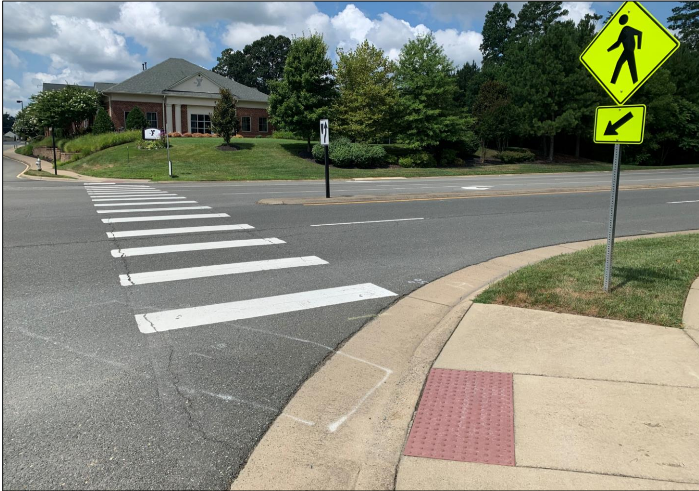
Hanover: Atlee Rd.