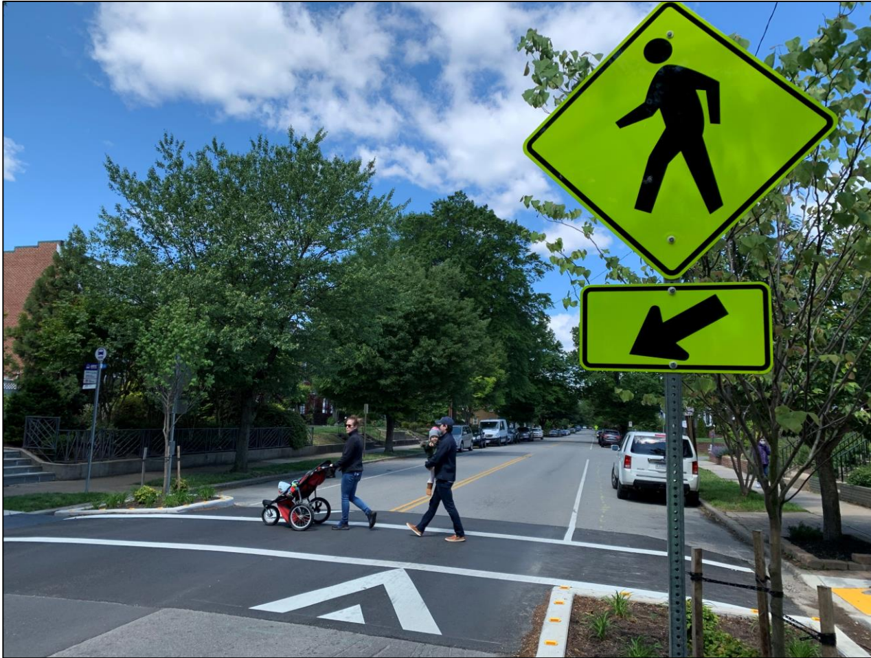
Richmond: Grove Ave.