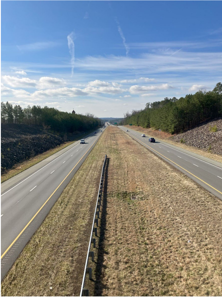
Photo: Rt. 288 from River Road, Goochland County