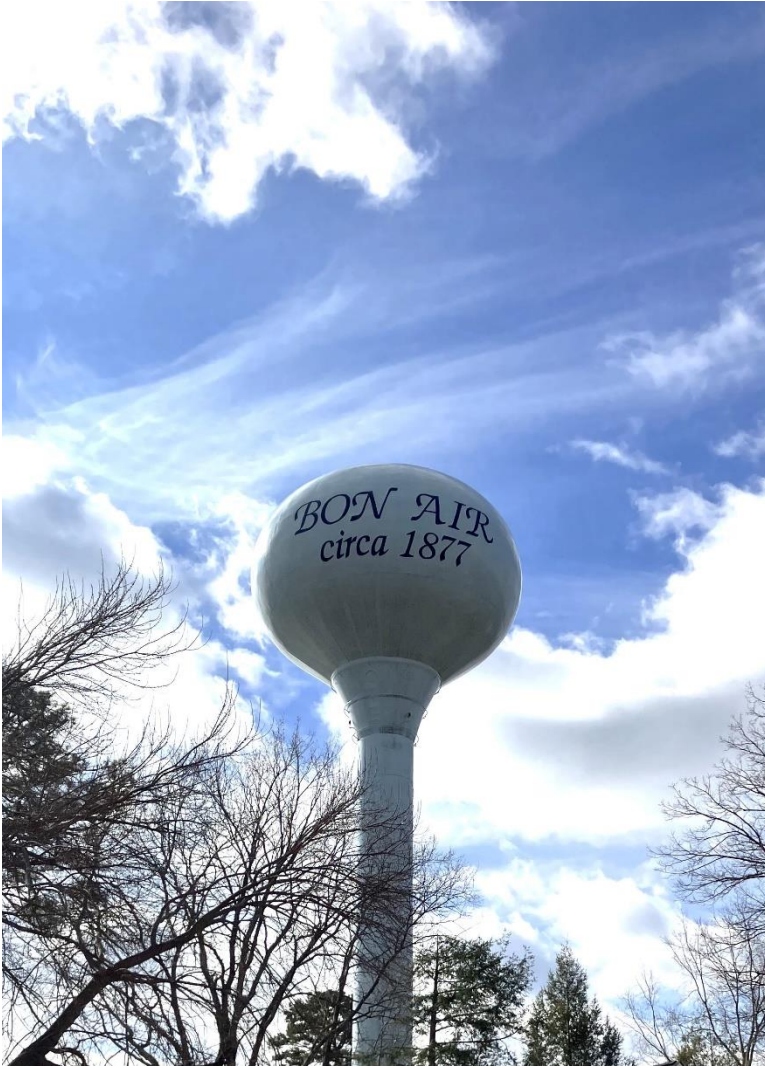
Bon Air Water Tower, Chesterfield County