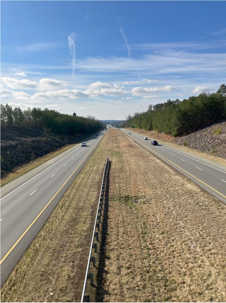
Photo: Rt. 288 from River Road, Goochland County