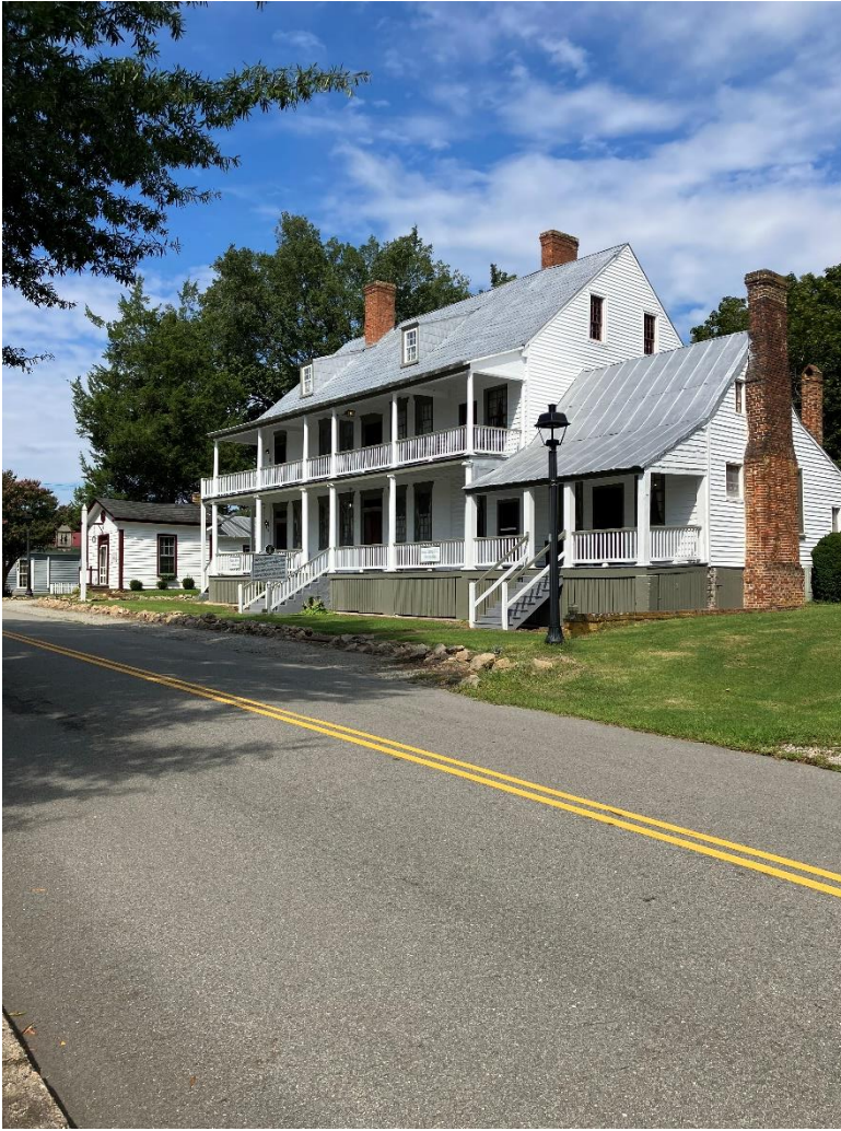
Photo: Atkinson's Hotel, Powhatan Courthouse