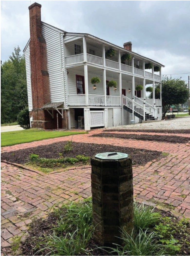
Photo: Half Way House Restaurant, Chesterfield County