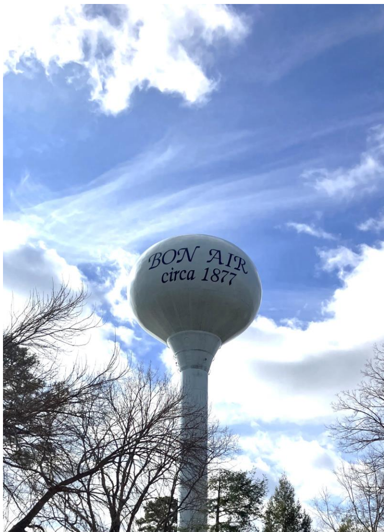
Photo: Bon Air Water Tower, Chesterfield County