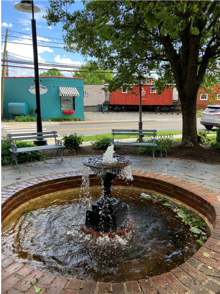
Image: Downtown Ashland

Members of the public are invited to submit public comments either verbally or in writing. Written comments can be submitted through the Q&A/Chat function on Zoom by email to RRTPO@PlanRVA.org . Written comments will be read aloud or summarized during the meeting when possible and will be included in the meeting minutes. Verbal comments will be taken during the Public Comment Period on the agenda. Please through the Q&A/Chat functions on Zoom if you would like to comment. When acknowledged by the Chairman, please clearly state your name so that it may be recorded in the meeting minutes.