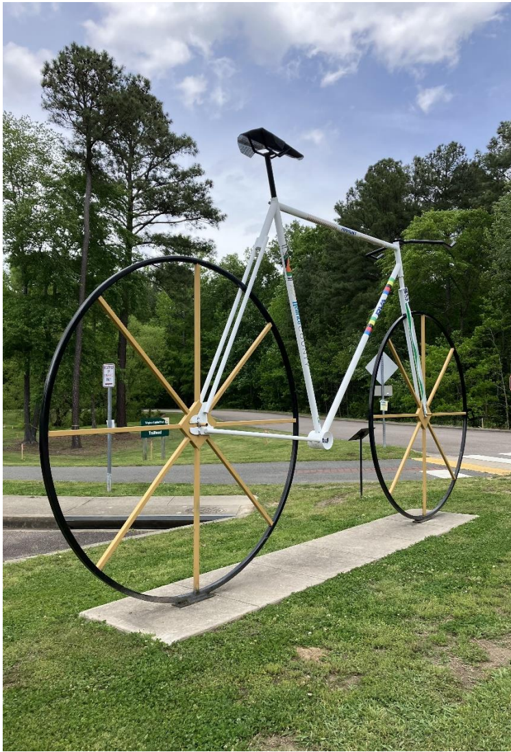
Photo: Bicycle sculpture at Four Mile Creek Park, Henrico County