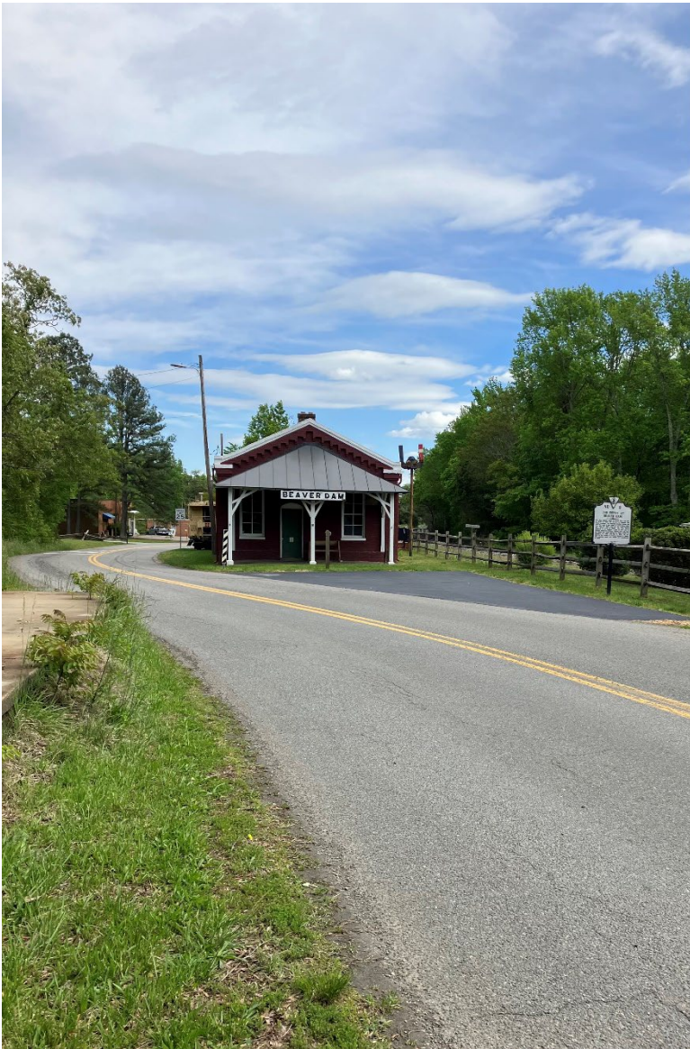
Photo: the Depot at Beaver Dam